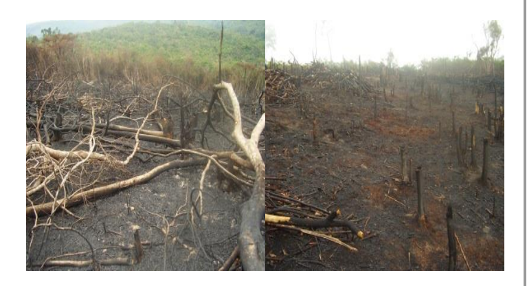
Burnt field and field in preparation for crops

After our visit, we noticed that smallholder agriculture is taking place therefore; we provided the necessary supplies to feed the Brazzaville's agglomeration. However, this agriculture is threatened because of human and natural factors. Agriculture is one of the biggest economic activities for the local communities in the area. Slash and burn agriculture is only rain-fed and thus highly climate dependent.