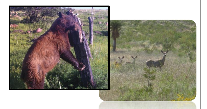
Wildlife : Black "Cinnamon" Bear and Mule deer with fawns in ranches that are part of the foundation.

Thanks to the management of planned grazing, our soil is protected by native grasses and brushes, which <u>cool</u> the soil temperature , <u>captures</u> more rainwater , <u>recharges</u> the aquifers , <u>cleans</u> the air we breathe through carbon sequestration, and promotes biodiversity .