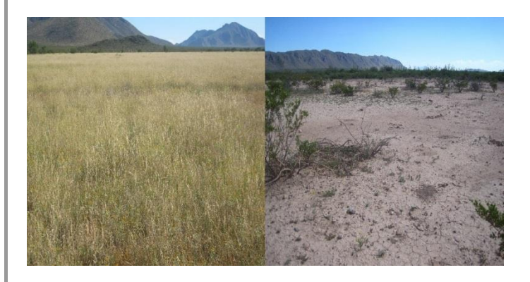
Distant Neighbors : These ranches from the Chihuahuan Desert are next to each other with the same rainfall. The one on the left is applying planned grazing management. The one on the right is not.

But, how do we reverse desertification? We mimic the great bison migrations, moving cattle everyday across pastures: breaking the soil with their hooves, fertilizing with their manure, and allowing the grass to fully recover before being grazed again.