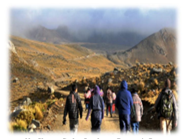
Nor Yauyos Cochas Landscape Reserve in Peru

protected that are dealing with land degradation as a result of human activities such as illegal mining, deforestation and unsustainable agriculture and tourism, among others.