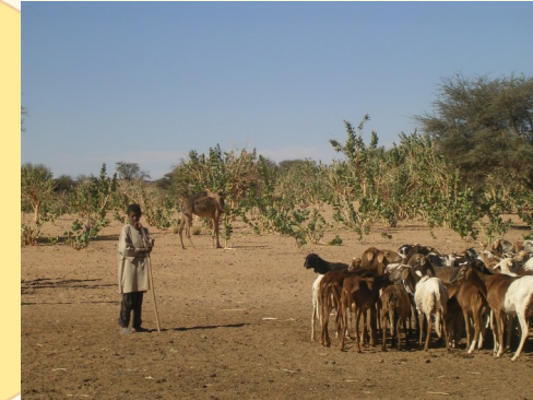
Niger, (CARI, 2007)

Agropastoral systems concentrate in areas with low densities of populations. They are based on the integration of livestock and crops. Animals contribute to soil fertilization while crops provide them with feeds. Herds' mobility ensures them access to water resources and rangeland in some periods of the year. Transhumance towards drier regions during wet season leave arable land free for cultivation. There exist a wide diversity of agropastoral systems, depending on animals' level of mobility and the type of crops cultivated (dry cereals, irrigated cereals, fodder trees). Herds are generally composed of small and big ruminants from local breeds.