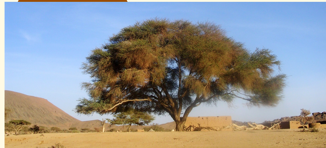
Niger (CARI, 2007)